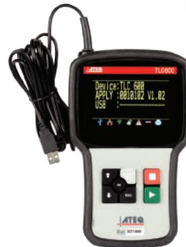
TLC 600 Remote control