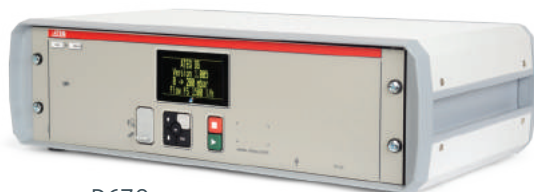
D670 19" 3U Case